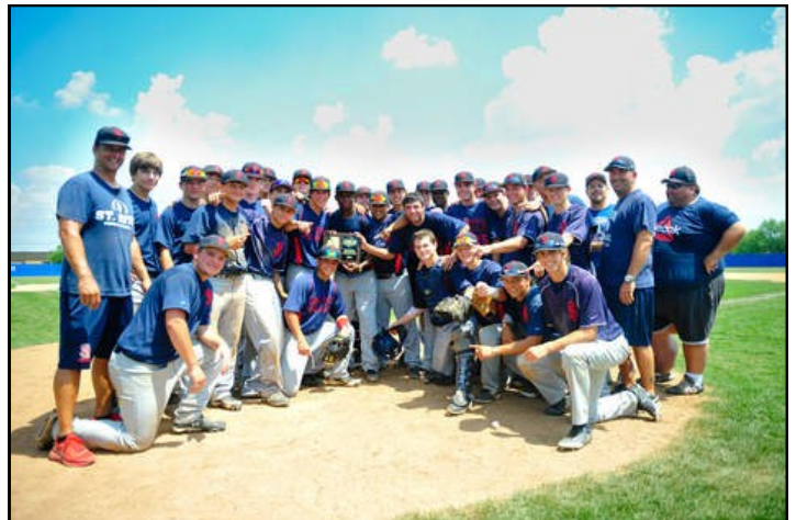
St. Rita after their Sectional win over St. Laurence